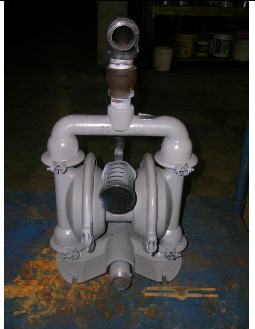
3) Pic no 111 2 EA WILDEN M-4 1 1/2" air diaphragm pump MOD M-4-WO-NE-NE-NE ser 207608 w/ air regulator, water trap & oiler 1 1/2" inlet/outlet