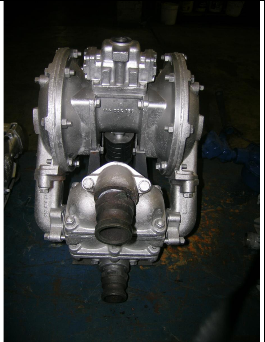
1) Pic no 109& 108 1EA WARREN RUPP 2" "SandPiper" air diaphragm pump w/Air Regulator, water trap & oiler. MOD SB2-A Type DB-1-CI. Cast Iron. 2" quick connect inlet/ outlet. Ser 280795