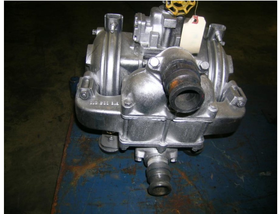
2) Pic no 110 18 EA WARREN RUPP 1 ½” “SandPiper” air diaphragm pump Ser 308313 MOD SB 1 ½ -A Type SB 4-CI Cast Iron 1 ½” quick connect inlet/outlet